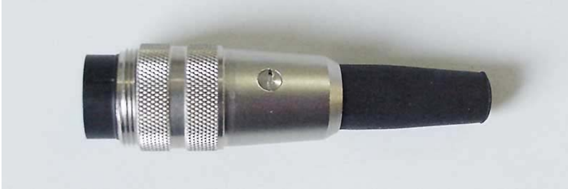
Connector Side View

Connector Type Information: DIN Connector 5-Pin / 270°