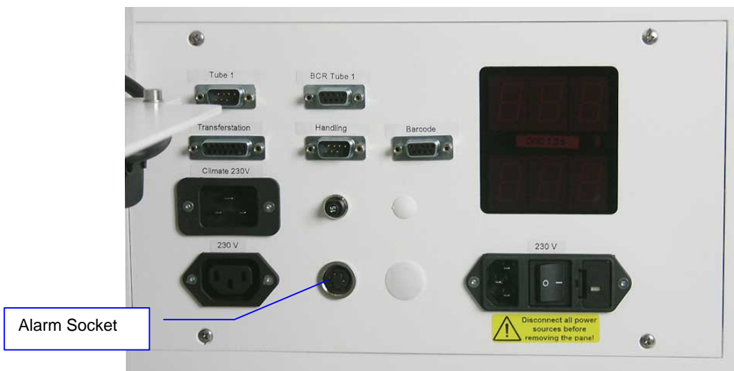
Location of Alarm Socket on Connector Panel