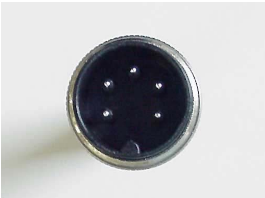
Connector Pin View